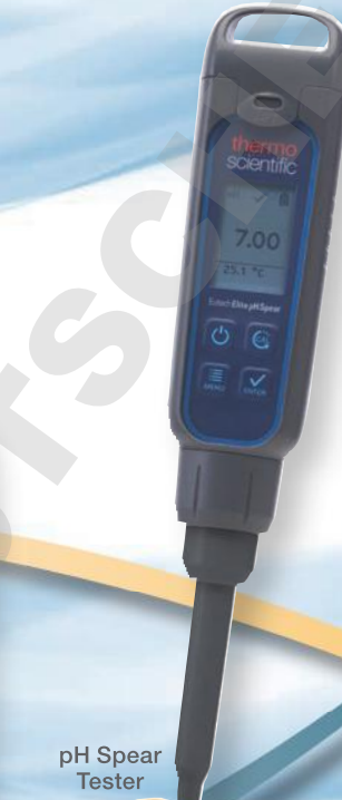
pH Spear Tester