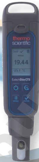
CTS Tester (Cup)