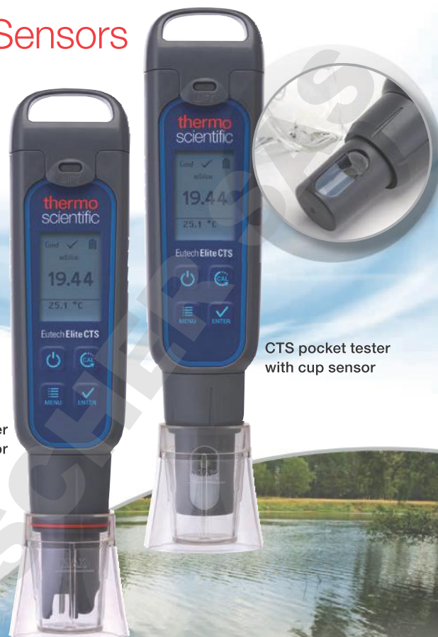
CTS pocket tester with pin sensor

The Eutech Elite CTS pocket tester simultaneously displays conductivity/TDS/salinity with temperature. These measurements are ideal in applications such as environmental, agriculture, aquaculture & aquariums, hydroponics, pools & spas, education, and industrial (cooling towers). Applications in these industries may require a constant measurement of salinity and total dissolved solids (TDS). The TDS measurement is dependent on the mix of chemical species as well as the concentration while conductivity is only dependent on the concentration of chemical species, measuring the ions carrying an electrical current.