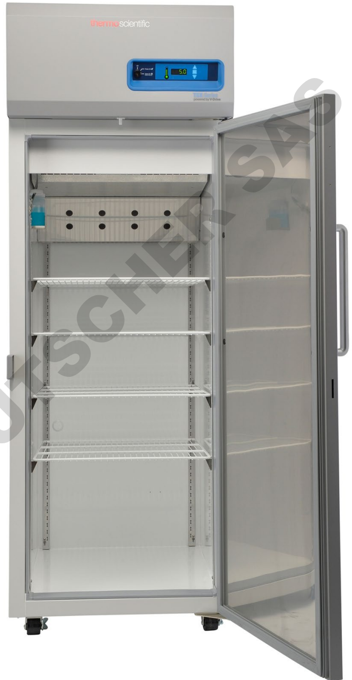
TSX Series refrigerator TSX2303SA

Other TSX high-performance refrigerators demonstrate similar energy savings. As another example, choosing the TSX2305SA high-performance laboratory refrigerator over the conventional Panasonic MPR-721-PA model would reduce energy use by 30.5%, saving more than 700 kWh of energy over the course of a year (Table 2). These savings represent 0.53 metric tons of CO 2 equivalents, or the greenhouse gas emissions from driving 1,300 miles in an average passenger car [3]. It also translates into energy cost savings of just over $75 per year [4], based on commercial sector electricity rates. The energy-efficient TSX Series refrigerators were designed with the environment in mind, which is a win for our company, our customers, and the planet.