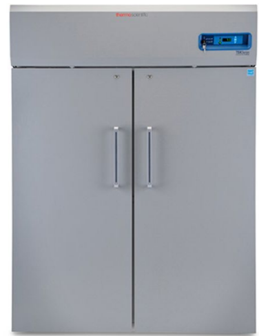
TSX Series refrigerator TSX5005SA

Our commitment to environmental responsibility doesn't end there. Our freezers and refrigerators are also manufactured in a zero waste certified facility, which means that more than 90% of the waste generated at our manufacturing site is diverted from landfills.