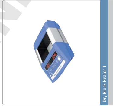
Dry Block Heater 1