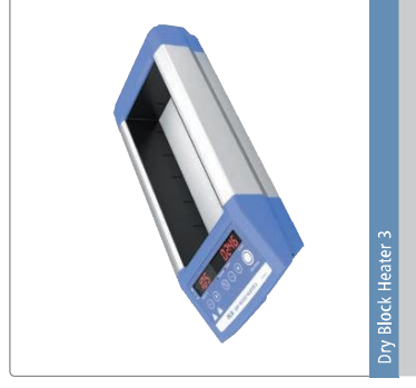
Dry Block Heater 3