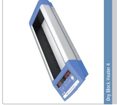
Dry Block Heater 4