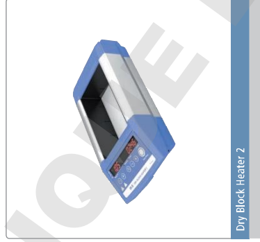
Dry Block Heater 2