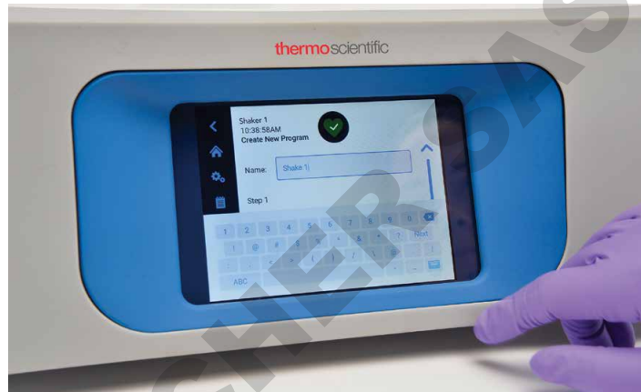
The large, bright user interface lets you easily monitor set points and status conditions from across the lab.

Solaris Orbital Shakers include a built-in orbital calculator that gives you the ability to convert protocols designed with different orbits and estimate the set speed needed to obtain similar results.