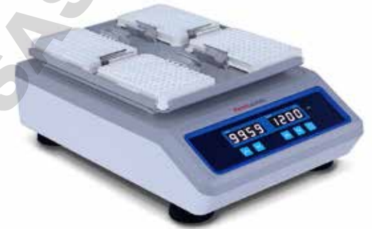
Digital Microplate Shaker shown with Thermo Scientific Clamp for 96-well Microplates.

Includes standard platform with 6 clamps (88882115) installed; holds 4 microplates. Warranty: 2 years | Certifications: cCSAus, CE