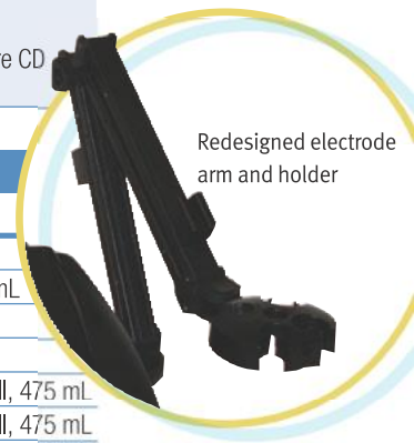
Redesigned electrode arm and holder