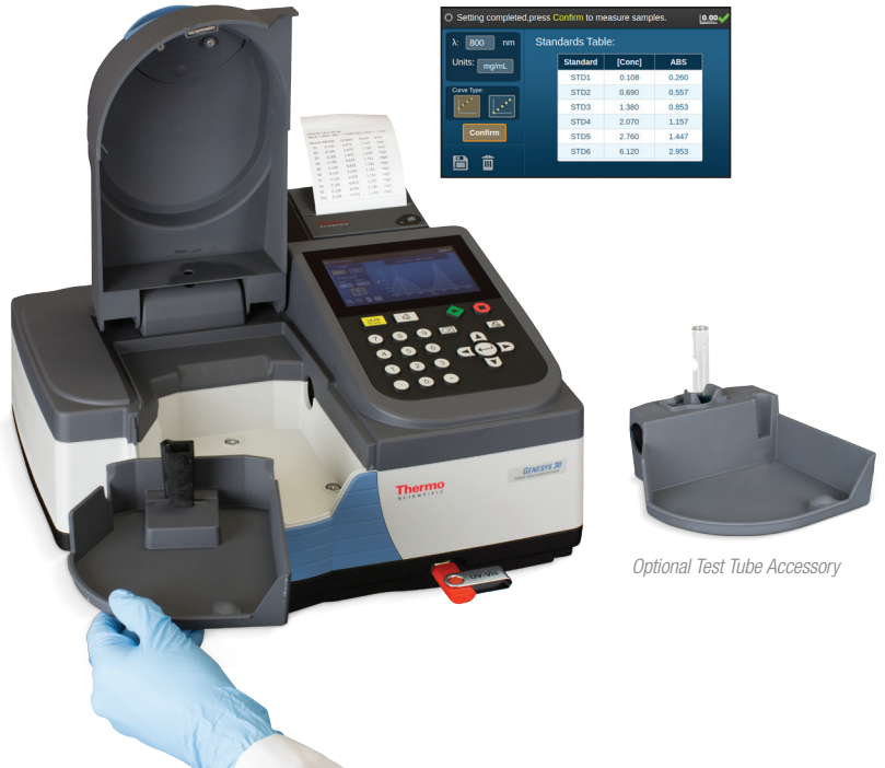
Optional Test Tube Accessory