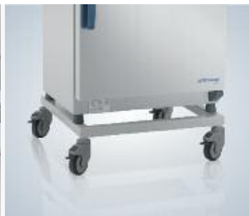
Support stand with casters