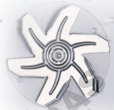
Fan adjustable in two speeds for matching the airflow to your application