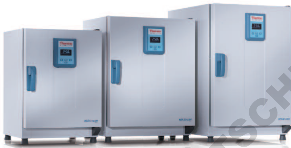
60 L, 100 L, 180 L models shown

Heratherm ovens have a smooth inner casing with easy to clean rounded corners