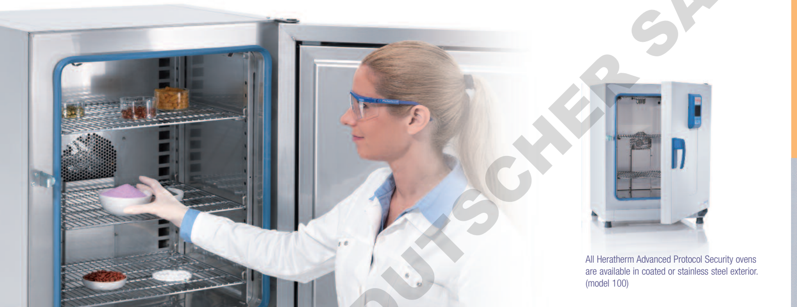
All Heratherm Advanced Protocol Security ovens are available in coated or stainless steel exterior. (model 100)

Our Advanced Protocol Security table top portfolio combines the benefits of our advanced protocol line with an extra layer of security for applications where process reliability and sample protection are paramount.