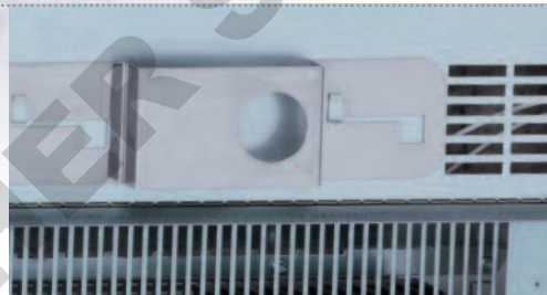
Operating up to 250 °C