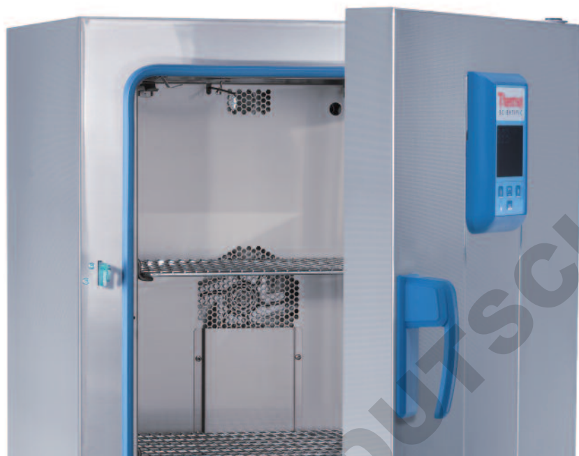
100 L model shown

As well as incorporating all the benefits of our General Protocol table top ovens, the Advanced Protocol range boasts additional features providing even more flexibility, accuracy and dependability.