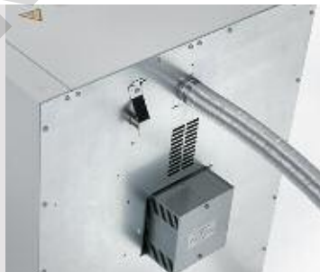
Underbench installation kit