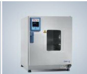
Viewing window in 100L unit