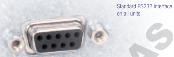
Standard RS232 interface on all units