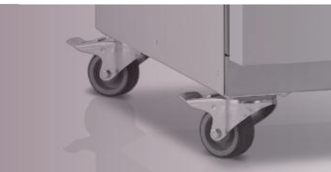
Factory installed casters allow for increased mobility and make setting up your lab easy.

Thermo Scientific Heratherm large capacity ovens offer 25% energy savings compared to conventional ovens*