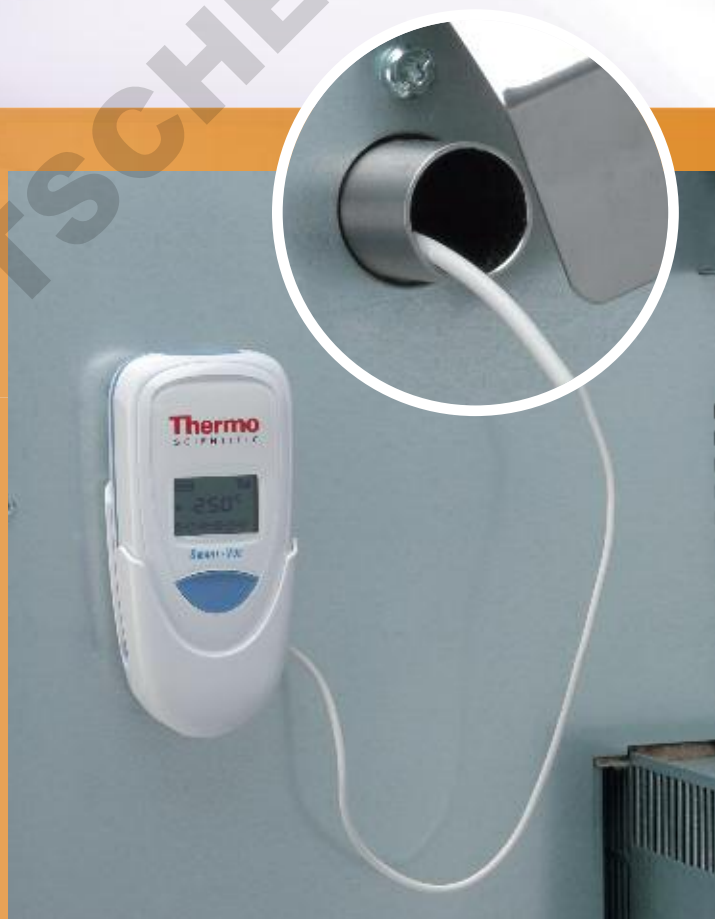
Rear view of the 100 L Advanced Protocol oven with Smart-Vue

Thermo SCIENTIFIC Part of Thermo Fisher Scientific