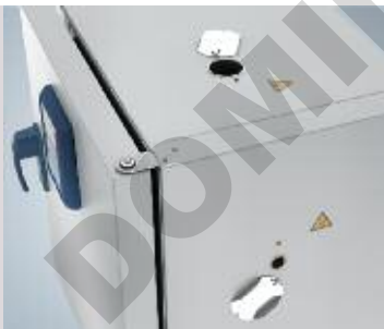
Access port top and right

Please ask for our special solutions. We can provide Heratherm tabletop ovens for cable testing applications, clean room applications, and inner casing with conditional gas-tightness for inert gas applications. We can provide additional access ports for the large capacity ovens at your preferred position, on demand.