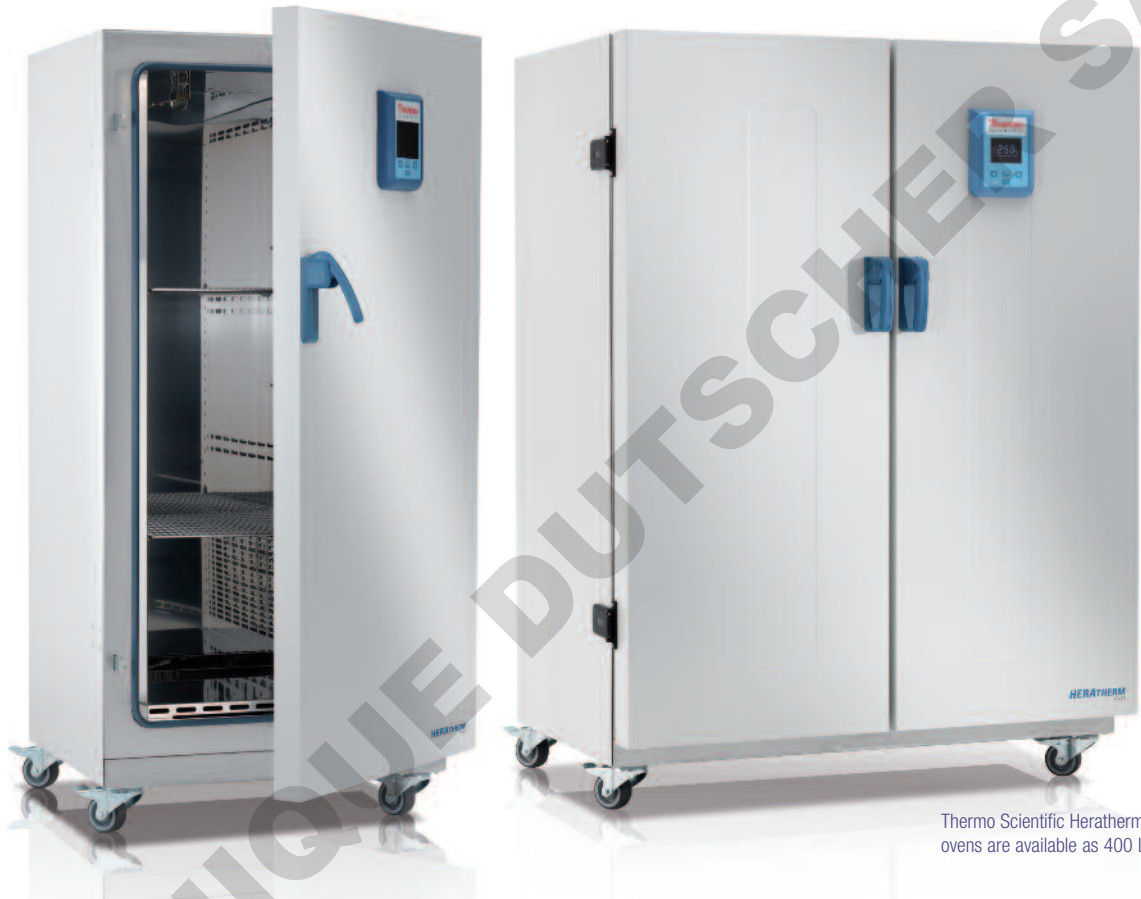
Thermo Scientific Heratherm large capacity ovens are available as 400 L and 750 L units

Heratherm large capacity ovens have been designed with your need for larger samples or high sample volume in mind. The General Protocol ovens provide high capacity for your day-to-day drying and heating applications.