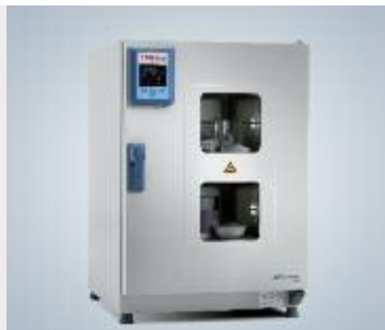
Viewing windows in 180L unit