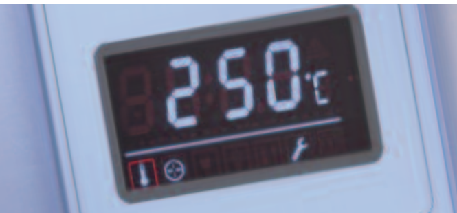
Easy to view, vacuum fluorescence display with simple to use touch button operation

Thermo Scientific Heratherm large capacity ovens offer 25% energy savings compared to conventional ovens*