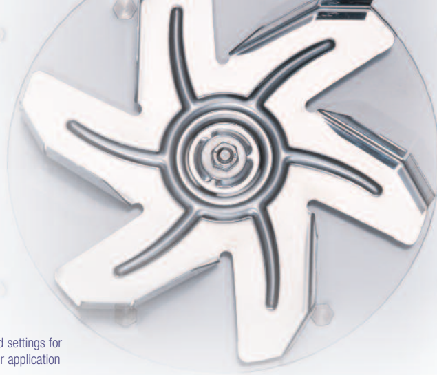
Fan adjustable in five speed settings for matching the airflow to your application