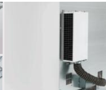
Fresh air particle Filter

a. Stainless steel perforated shelves b. Reinforced shelves