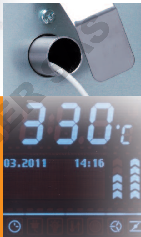
Operating temperatures as high as 330 °C