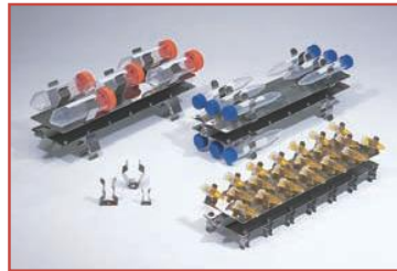
Multi-Tube Carousels for Little SHOT III

Models 230552 & 230332 - The Multi-Tube Carousels work with a variety of interchangeable clip sizes to hold a combination of 50 mL, 15 mL, 2.0 mL, and 1.5 mL tubes, allowing for simultaneous processing of multiple sized tubes. The clips are supplied with mounting hardware, and mount onto the plates on the carousel. Depending on the tube size, the tubes may be positioned horizontally, vertically, or at an angle.