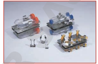
Multi-Tube Carousels for Bambino