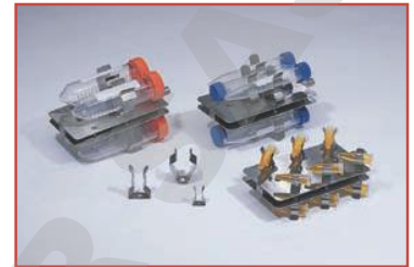
Multi-Tube Carousels for Bambino