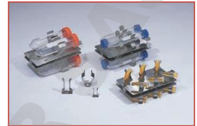
Multi-Tube Carousels for Bambino