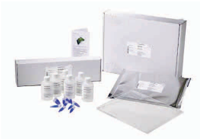
Figure 3.1: DIGE Gel and DIGE Buffer Kit.

The DIGE Buffer Kit contains all the reagents necessary for a single run of up to 12 DIGE Gels in the Ettan DALT twelve electrophoresis unit and two runs of up to 6 gels in the Ettan DALT six electrophoresis unit, see Fig. 3.1, on page 6 .