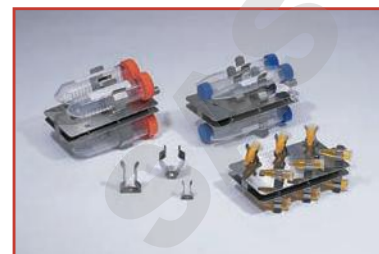
Multi-Tube Carousels for Bambino