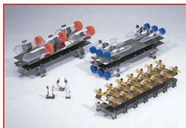
Multi-Tube Carousels for Little SHOT III

Models 230552 & 230332 - The Multi-Tube Carousels work with a variety of interchangeable clip sizes to hold a combination of 50 mL, 15 mL, 2.0 mL, and 1.5 mL tubes, allowing for simultaneous processing of multiple sized tubes. The clips are supplied with mounting hardware, and mount onto the plates on the carousel. Depending on the tube size, the tubes may be positioned horizontally, vertically, or at an angle.