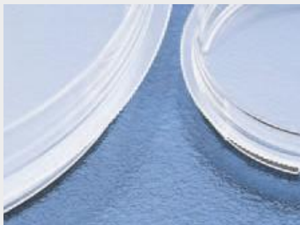
The gripping ring: often copied, never like the original!

The TPP Gripping Ring: often copied, but never like the original!