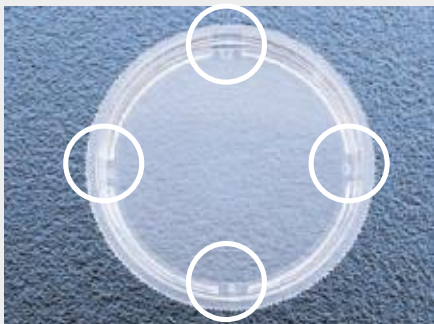
Clock-numbering system inlaid into the base of the dish