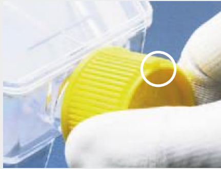
«VENT»-position at 12 o'clock = gas exchange