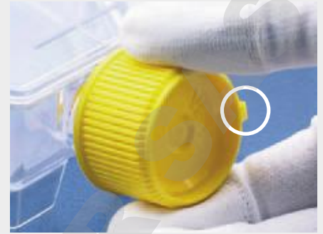
«VENT»-position at 3 o'clock = gas tight