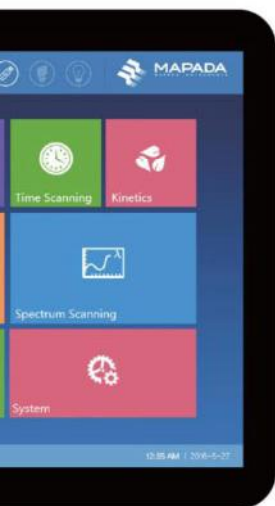
New design UI