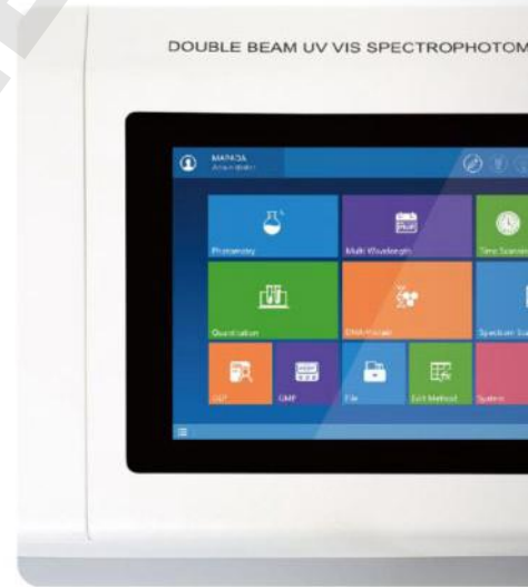
New design UI