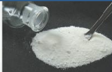
Sugars and Sweeteners