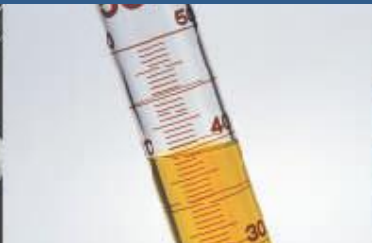
Essential oils, Flavors and Fragrances