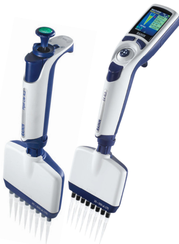
Pipet-Lite XLS+ and E4 XLS+ models

Speed plate work with the Rainin E4 XLS+ electronic multichannel pipettes. Specialized modes streamline how you transfer multiple aliquots, perform serial dilutions and program complex pipetting routines.