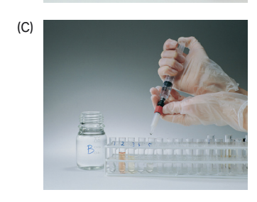
Fig 3. Using HiTrap NHS-activated HP with a syringe. (A) Prepare buffers and sample. Remove the column's top cap and snap off the end. Wash and equilibrate. (B) Load the sample and begin collecting fractions. (C) Elute and continue collecting fractions.