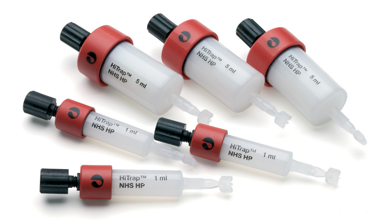
Fig 1. Prepacked with NHS-activated Sepharose High Performance, HiTrap NHS-activated HP columns allow for easy ligand coupling, allowing a wide range of uses.

HiTrap NHS-activated HP is comprised of an N-hydroxy-succinimide (NHS) ester attached by epichloro-hydrine to Sepharose High Performance via a 6-atom spacer arm. This esterification leads to the formation of activated esters, which react rapidly and