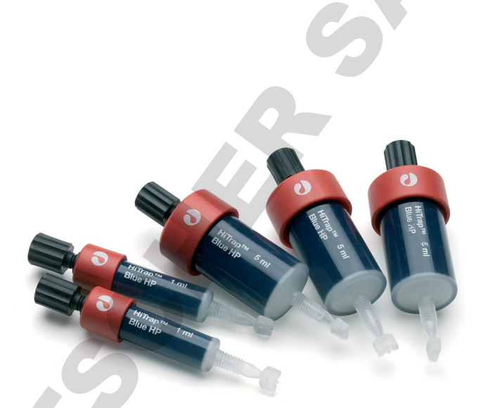
Fig 1. Prepacked with Blue Sepharose High Performance, HiTrap Blue HP columns offer fast and simple affinity purifications of proteins such as albumin, interferon, a broad range of nucleotide requiring enzymes, \alpha_2 -macroglobulin, coagulation factors, and nucleic acid binding proteins.

The dye ligand, Cibacron Blue F3G-A, is covalently attached to the Sepharose High Performance matrix via the triazine part of the dye molecule. It belongs to a special class of group-specific ligands of considerable utility. Cibacron Blue F3G-A shows certain structural similarities to naturally occurring molecules