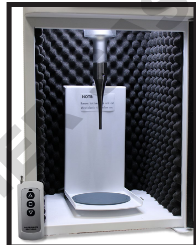
Soundproof enclosure with lights, motorized lift and remote control