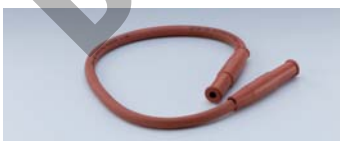
Gas-safety hose for natural gas, slip-on (DVGW-certified)

If the flame stops due to e.g. spilled liquids and the burner may not be re-ignited, the gas supply is automatically and permanently shut.