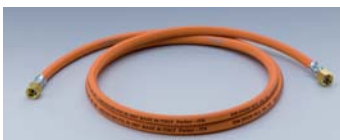
Gas-safety hose for propane/butane, screwed (DVGW-certified)

Sources of energy? You need it - we have it