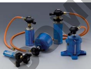
Choice of gas cartridges with adapters, partially including pressure reducer and gas-safety hose.