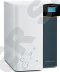
arium® advance Series Pure water systems