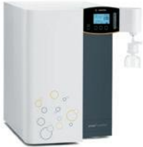
arium® comfort Series Combined pure and ultrapure water systems