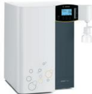
arium® pro Series Ultrapure water systems; any application-specific configuration can be selected