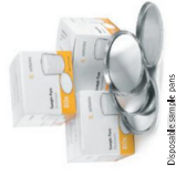
Disposable sample pans

* DMSX = German accreditation body recognized throughout Europe