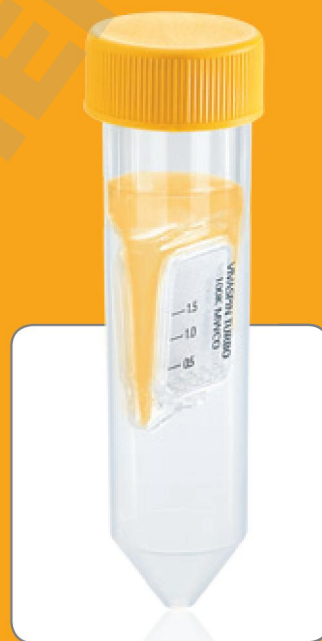
Vivaspin Turbo 15 15 ml – 100 \mu l