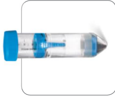
Vivaspin 20 20 ml – 50 µl