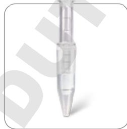
Vivaspin 2 2 ml – 8 \mu l