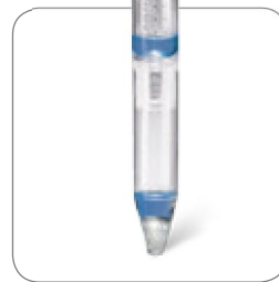
Vivaspin 6 6 ml – 30 \mu l