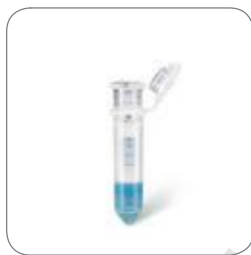
Vivaspin 500 500 \mu l* – 5 \mu l**

The patented dead-stop technology allowing direct recovery of the concentrate without further respin assures incomparably safe sample handling and convenience.