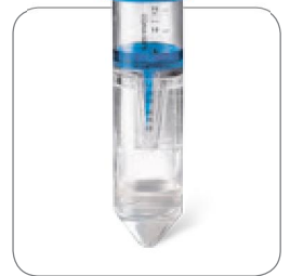
Vivaspin 15R 15 ml – 30 \mu l