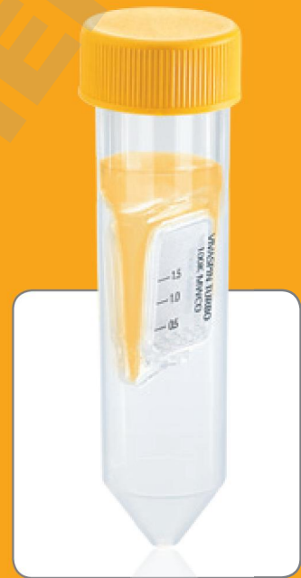
Vivaspin Turbo 15 15 ml – 100 \mu l