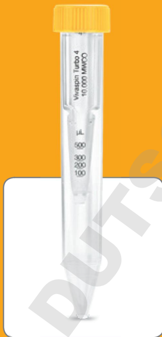
Vivaspin Turbo 4 4 ml – 30 \mu l