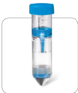
Vivaspin 20 20 ml – 50 \mu l