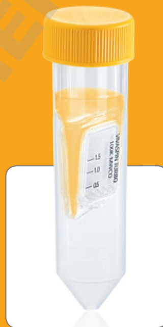
Vivaspin Turbo 15 15 ml – 100 \mu l