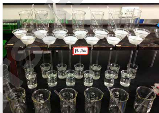
Fig 3. Retention of \text{PbSO}_4 precipitate using Whatman Grade 40 filter paper.