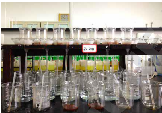
Fig 4. Use of Whatman Grade 41 filter paper in zinc analysis.