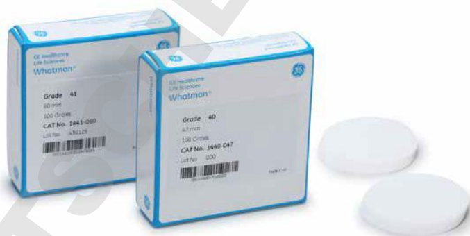
Fig 1. Whatman Grades 40 and 41 quantitative ashless filter paper.

In mining industries, analytical quality control (QC) laboratories routinely test the content of different metals in ore samples. Sample preparation is a critical factor in obtaining consistent results. Therefore, the use of high-quality, dedicated filter paper is expected to improve the accuracy of these metal content tests. Whatman quantitative filter paper from GE Healthcare Life Sciences is made from pure cotton and treated to wash away most of the impurities. Whatman quantitative paper is useful for gravimetric analysis and the preparation of samples for instrumental analysis. Compared with other papers, Whatman quantitative ashless filter paper (Fig 1) gives high loading capacity and particle retention, both of which are useful for the analysis of metals and other substances in ore samples.