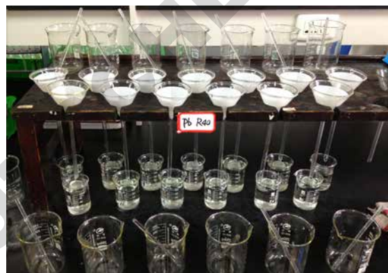
Fig 3. Retention of \text{PbSO}_4 precipitate using Whatman Grade 40 filter paper.