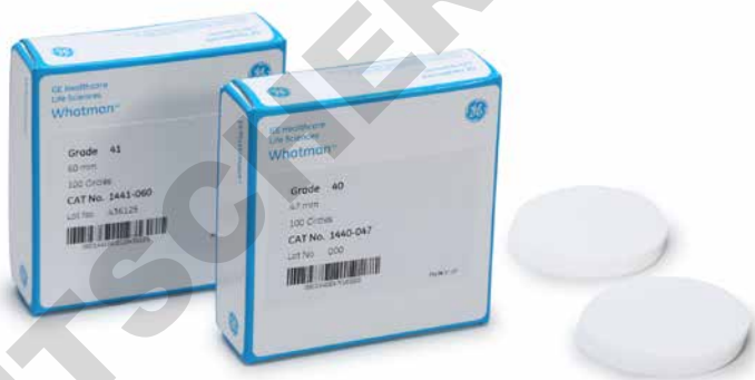
Fig 1. Whatman Grades 40 and 41 quantitative ashless filter paper.

In mining industries, analytical quality control (QC) laboratories routinely test the content of different metals in ore samples. Sample preparation is a critical factor in obtaining consistent results. Therefore, the use of high-quality, dedicated filter paper is expected to improve the accuracy of these metal content tests. Whatman quantitative filter paper from GE Healthcare Life Sciences is made from pure cotton and treated to wash away most of the impurities. Whatman quantitative paper is useful for gravimetric analysis and the preparation of samples for instrumental analysis. Compared with other papers, Whatman quantitative ashless filter paper (Fig 1) gives high loading capacity and particle retention, both of which are useful for the analysis of metals and other substances in ore samples.