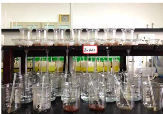
Fig 4. Use of Whatman Grade 41 filter paper in zinc analysis.