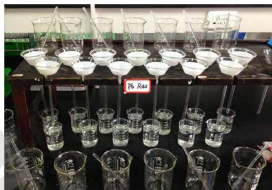
Fig 3. Retention of \text{PbSO}_4 precipitate using Whatman Grade 40 filter paper.