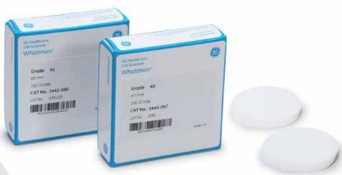
Fig 1. Whatman Grades 40 and 41 quantitative ashless filter paper.

In mining industries, analytical quality control (QC) laboratories routinely test the content of different metals in ore samples. Sample preparation is a critical factor in obtaining consistent results. Therefore, the use of high-quality, dedicated filter paper is expected to improve the accuracy of these metal content tests. Whatman quantitative filter paper from GE Healthcare Life Sciences is made from pure cotton and treated to wash away most of the impurities. Whatman quantitative paper is useful for gravimetric analysis and the preparation of samples for instrumental analysis. Compared with other papers, Whatman quantitative ashless filter paper (Fig 1) gives high loading capacity and particle retention, both of which are useful for the analysis of metals and other substances in ore samples.