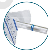
Fiber free paper wrap ensures quick peel apart opening