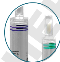
Color coded rings for easy identification

Pipettes are supplied individually wrapped in a fiber-free paper & plastic combination that is easy to open or available in bulk. The uniform mouth piece fits all major pipettors and have color coded TD rings for ease of identification. 1.1 & 2.2 bacteriological pipettes meet the A.P.H.A. standards for the examination of dairy products. Calibrated TD with blow out. Meets AST < E934. Dispenser box allows user to remove pipettes without opening top. Universal stacking design requires less laboratory space and each box is color coded for easy recognition.