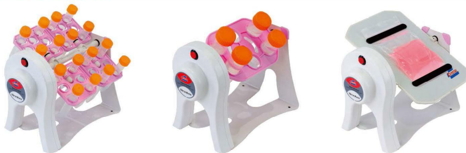
Tube Revolver with Fixed Speed TR-01A (Previous Model HYQ-1130A)