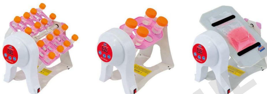
Tube Revolver with Variable Speed and Digital Display TR-02UA (Previous Model HYQ-1131A)