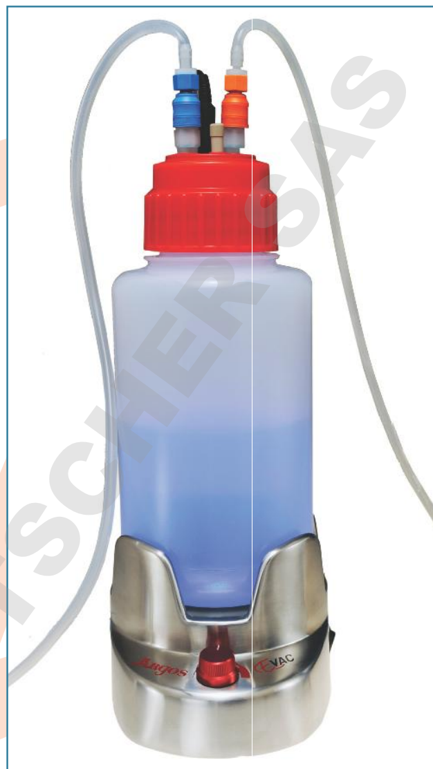
Illuminated LED light allows for easy viewing of fluid level

E-Vac is available with a 4-L polypropylene bottle or a 3-L glass bottle. Polypropylene and glass bottles offer lids equipped with quick-release tubing connectors for safe and convenient tubing connections; and level detection sensor that automatically shuts the pump off when the bottle is full. Polypropylene bottle also available with lid fitted with standard barbed tube fittings.