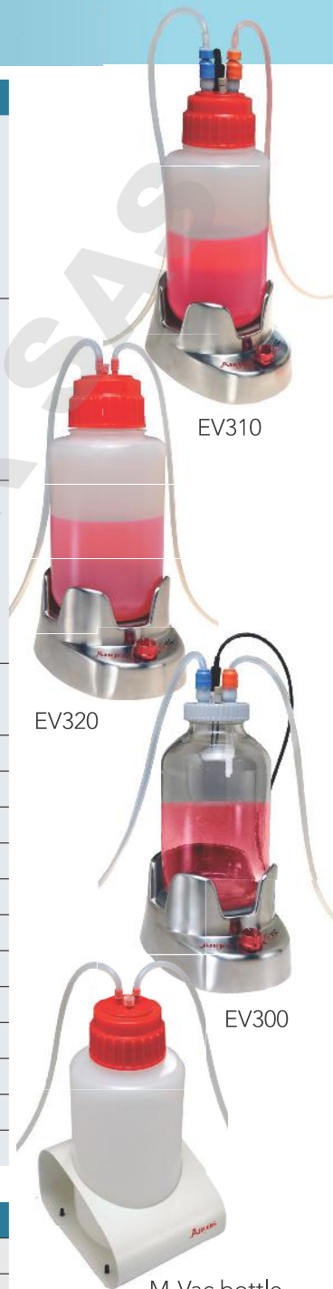
M-Vac bottle and stand sold separately