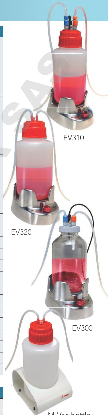
M-Vac bottle and stand sold separately