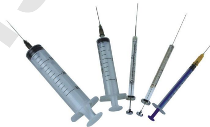
Applicable to different syringes