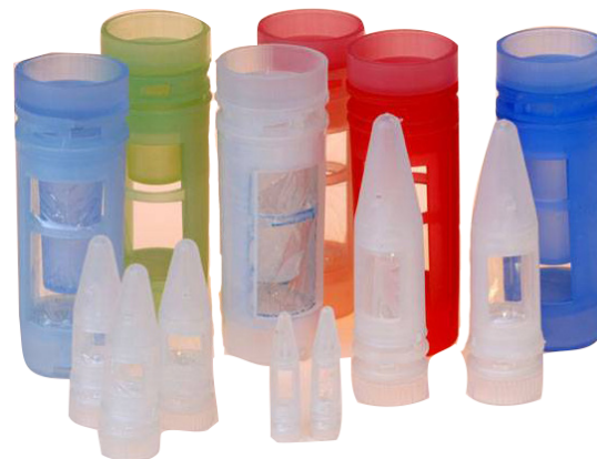
ReadyLyzer are available in different formats. They are ready-to-use and easy to handle.

The ReadyLyzer are available in 5 different sample volume capacities: 10 - 250 \mu l, 50 - 800 \mu l, 0.1 - 3 ml, 10 ml and 20 ml.