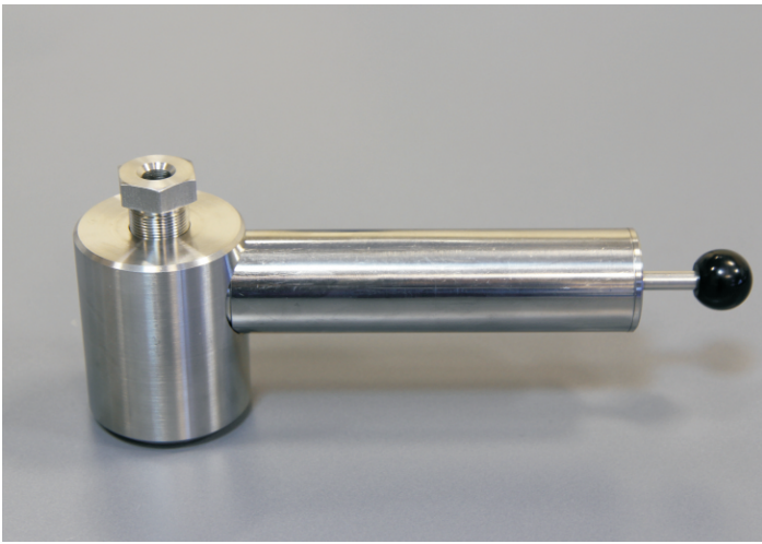
Stainless Steel Pump Sampler