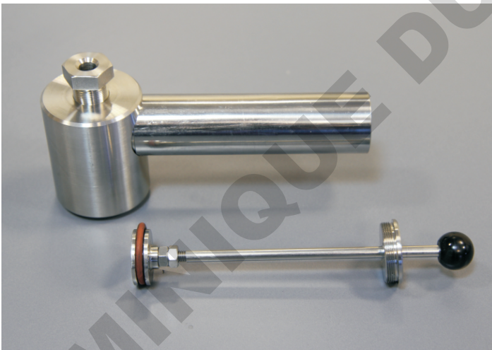
Large Silicone O-ring on Plunger