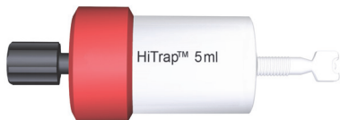
Fig 2. HiTrap, 5 mL column.

Note: HiTrap columns cannot be opened or refilled.