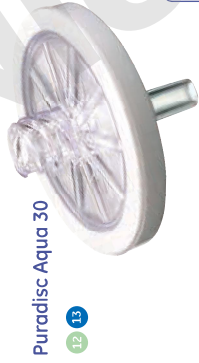
Puradisc Aqua 30