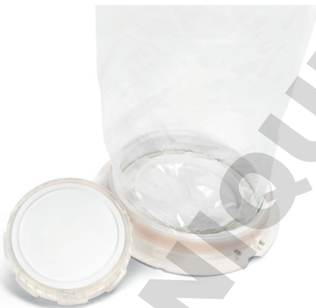
Gelatine Filters in Biosafe® Bags