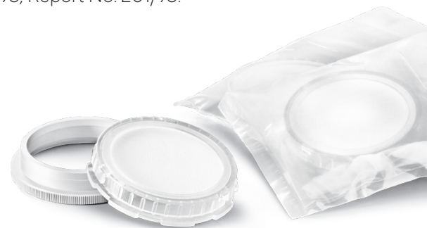
Gelatine Filter Disposables