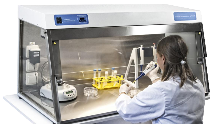
UVT-S-AR – double PCR workstation