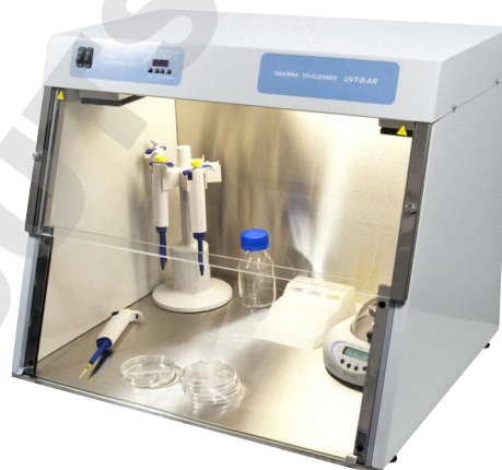
UVT-B-AR – economy UV cabinet