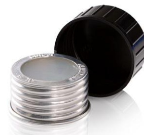
DURAN® Aluminium Open Top Cap with Silicone Septum, and Over-cap