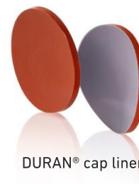
DURAN® cap liner

*Use of accessories reduces maximum recommended temperature: stopper (121 °C) or septa (200 °C).