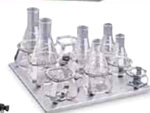
I5230 (clamps sold separately)