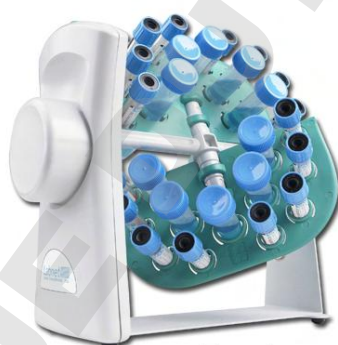
Revolver with H5600-15 Rotisserie