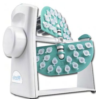
Revolver with Standard Rotisserie

With a molded housing and unique rotisserie design, the Revolver is easy to clean and decontaminate. A 36 x 1.5/2.0 ml rotisserie is supplied with the Revolver. Other configurations are available separately.