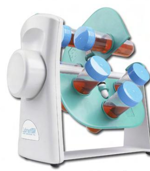
Revolver with H5600-50 Rotisserie