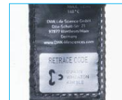
Lot Specific Retrace Code for traceability and certification