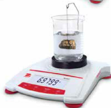
Scout shown with optional Density Determination Kit

It's all about accuracy and efficiency with the OHAUS Scout balance. Stabilization time as fast as 1 second combined with high resolution deliver extremely precise and repeatable weighing results that you can count on time and time again. This makes the Scout ideal for routine experiments and other weighing applications in your classroom.